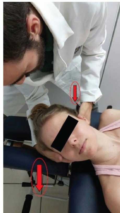
Figure 2. Sham Manipulative Procedure for the Cervical Spine. Small arrow: Chiropractor's hand on the paraspinal area in the restricted vertebra. Big arrow: Chiropractor's forearm as a support for patient head and giving a thrust against the drop headpiece.