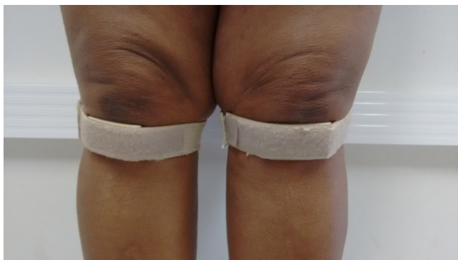
Figure 1: Sub-patellar strip

The evaluation consisted of two situations: 1) normal information condition, without the inclusion of the sub-patellar strip; 2) Additional sensory information condition: with the careful use of the sub-patellar strip, brand Salvape® (SalvaPé Orthopedic Products®), with a width of 2 cm, placed bilaterally, in orthostatic position. (Figure 1)