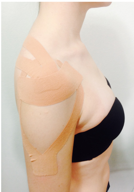
FIGURE 2 - Placement method of the kinesio taping

proposed by KT on the upper trapezius muscles and middle deltoid which are the main affected in patients with SIS. Being formed by strips which act directly on both muscles.